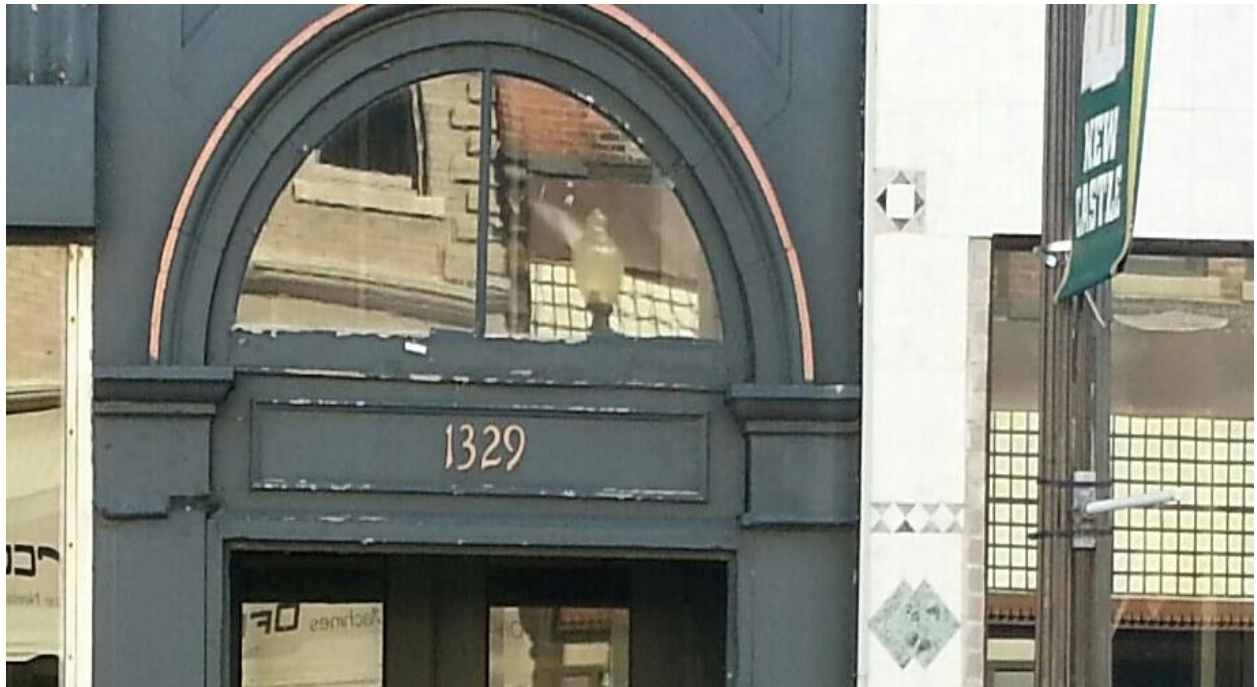
Jennings Project: New Business and New Housing