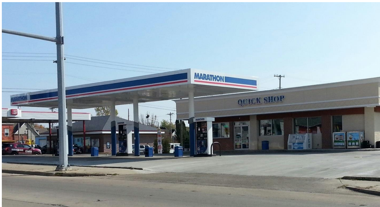
A new gasoline station and “quick” store opened on East Broad Street.