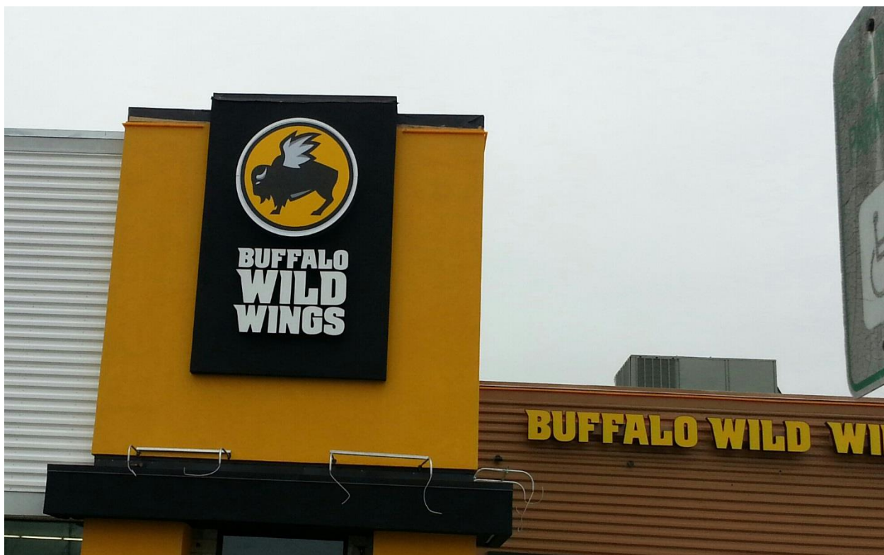
Buffalo Wild Wings is scheduled to open in November!