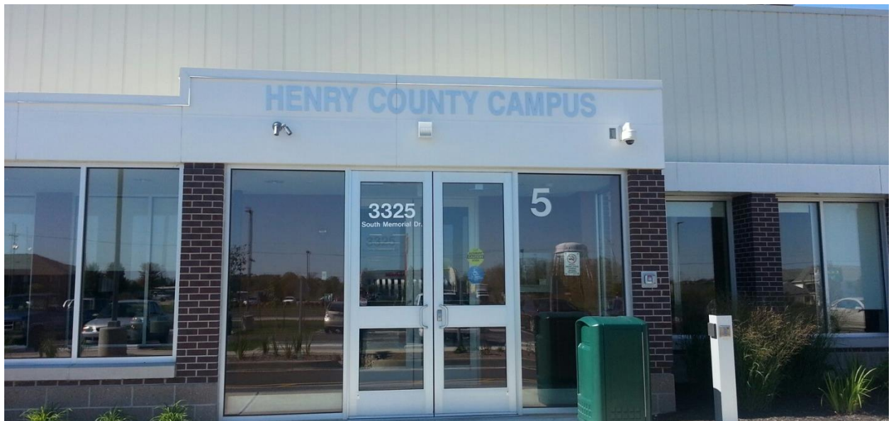
IVY Tech Campus in New Castle opened to students this year.