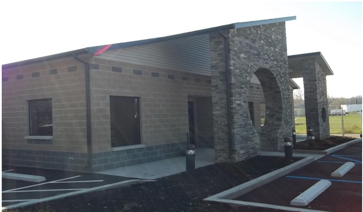
New Animal Shelter is showcased at the December Open House