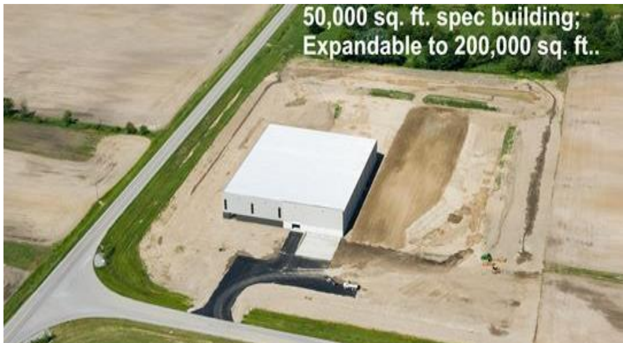
Industrial Park: 3995 Brooks Drive, New Castle, IN 47362