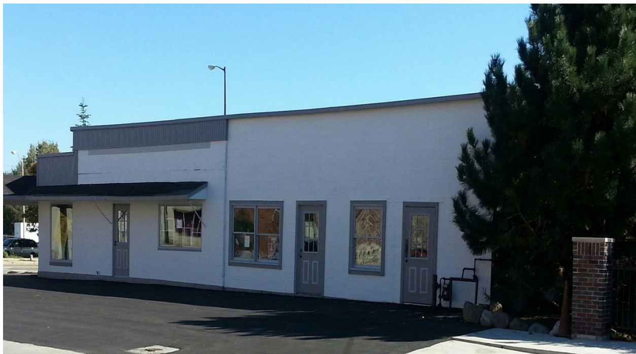
The Newly-Painted Art Annex