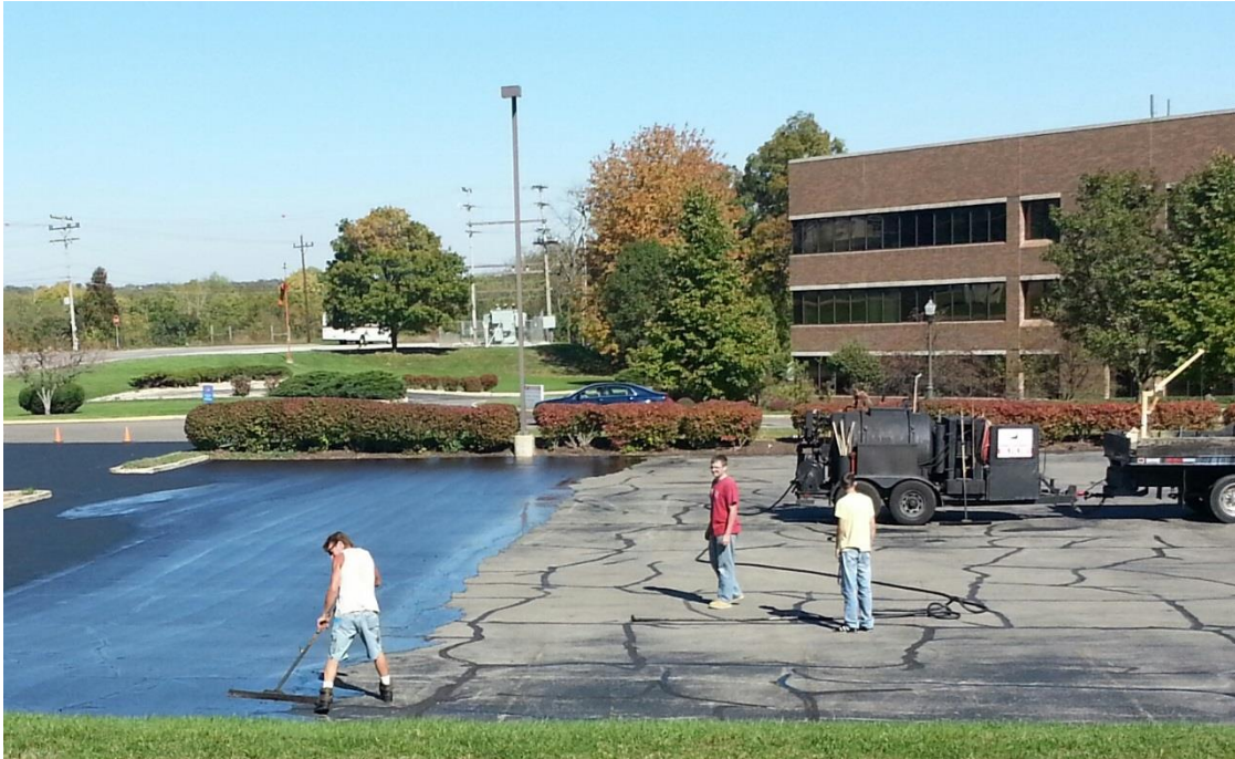
Maintaining excellence: Henry County Hospital re-seals its parking lot this October. (Lovely. Thank you!)