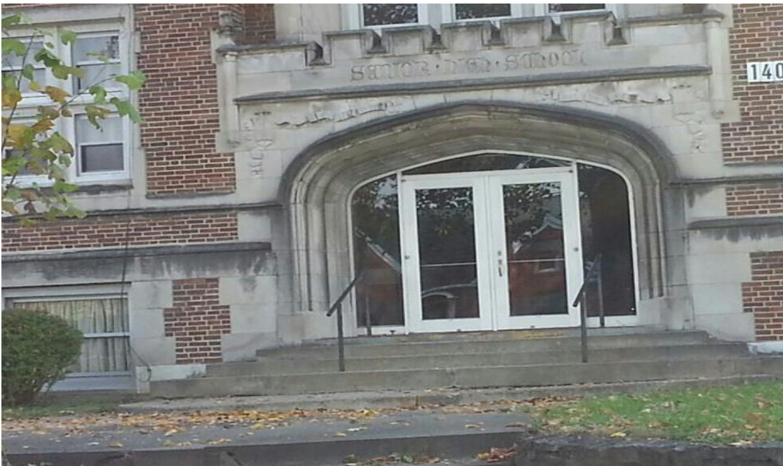
An effort is being made to create temporary housing for homeless men, using the old senior high school. Called "The House," several rooms have been created to move homeless men from the streets, to shelter, feed, and mentor them. This also relieves the overcrowding at Love Center.