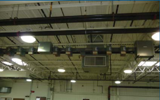
One of Four 800 Amp Buss Runs