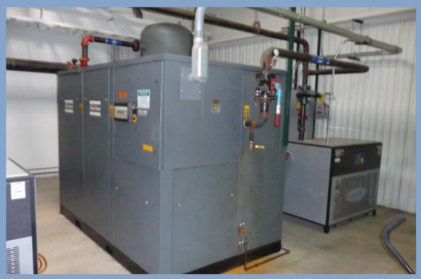
One of two air compressors, 125 horsepower