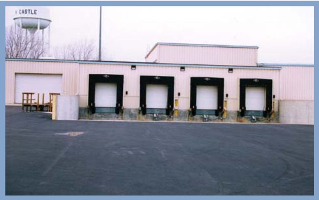
East dock doors