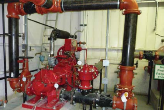
Diesel Pump new 2004