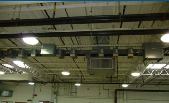
One of Four 800 Amp Buss Runs