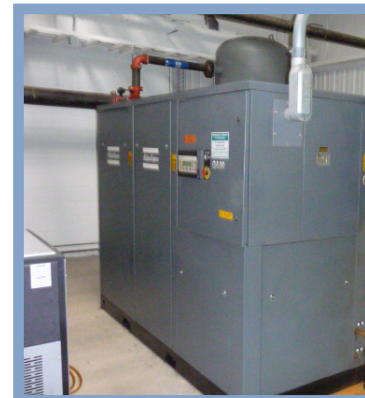
One of two air compressors, 1